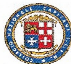
COLLEGIO NAZIONALE CAPITANI LUNGO CORSO E MACCHINA